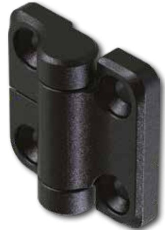
With Threaded Studs M8